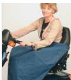
Driving wrap. Thermal.