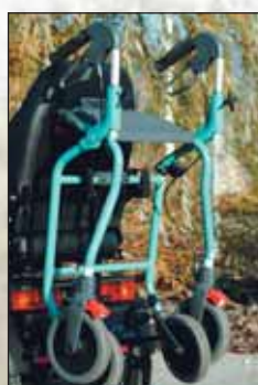
Walking frame holder.