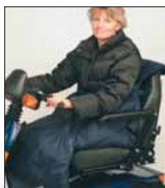
Driving thermal bag.