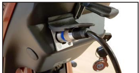
Connect the charging plug to the 3-pin socket on the steering column. The charging socket is located under the protective cover.