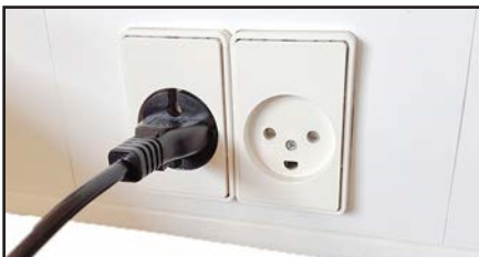
Connect the plug to the wall socket

For further information see the User Manual.