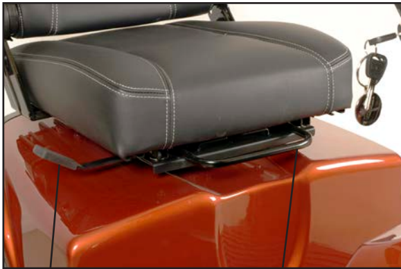
Release lever for seat rotation. Release lever for seat forward/back.

Other seats that can be supplied for the Mini Crosser work on similar principles. The release lever is normally located on the right, but can be put on the left if so wished.